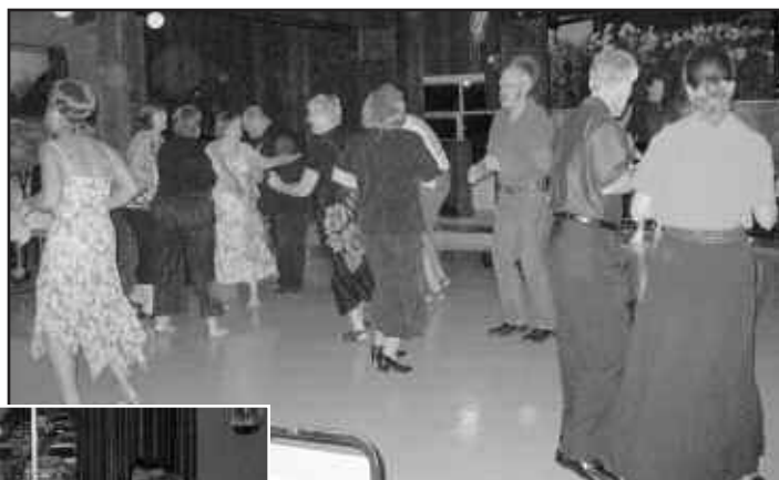
Shimmying and shaking: The Personics kept OSC members on their feet all night long.