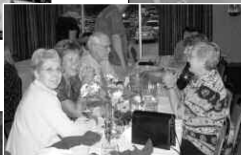
OSC members enjoy banter and beverages before the business meeting.